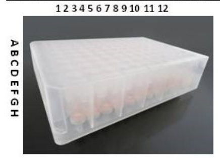
Each well contains a silica-based membrane (Secured by a Red O-ring)