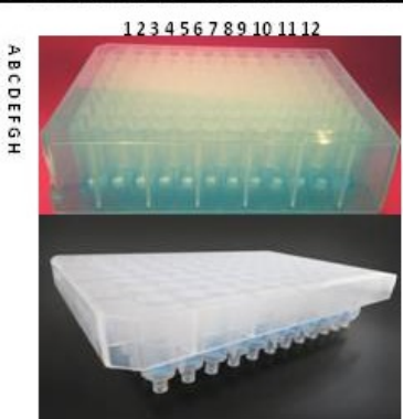
(Secured by a Blue O-ring)